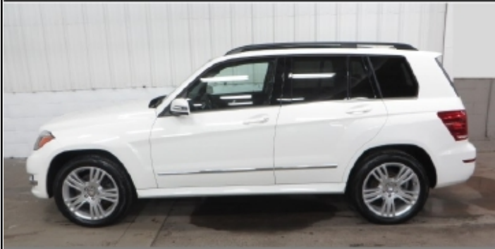
2013 Mercedes-Benz GLK350 4Matic Call For More Information 716-633-0088