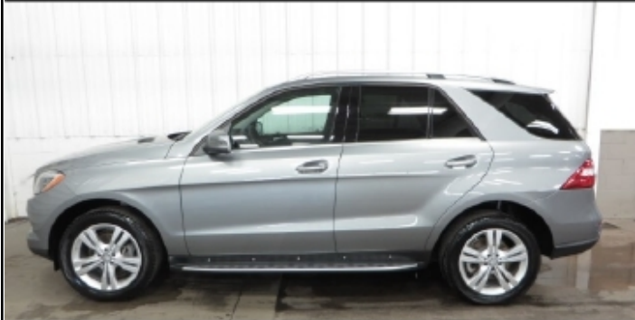
2013 Mercedes-Benz ML350 4Matic Call For More Information 716-633-0088