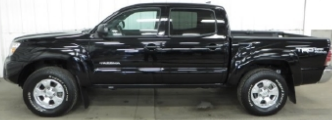
2014 Toyota Tacoma