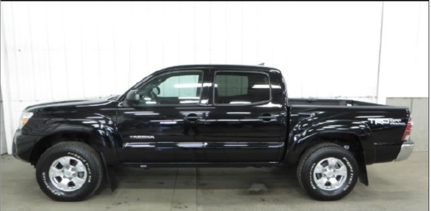
2014 Toyota Tacoma