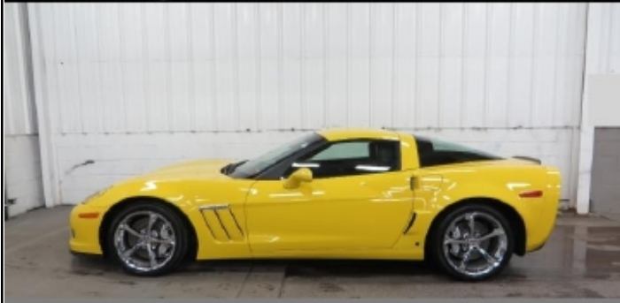
2012 Chevrolet Corvette Grand Sport Call For More Information 716-633-0088